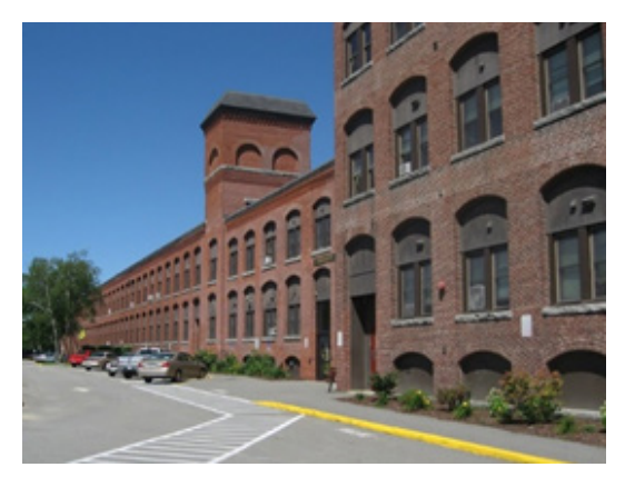
Penobscot River House, Old Town, Maine

Gateway Seniors Without Walls (GSWW) is off to a great start in 2018. Our year was "jump-started" last December when we met with our Advisory Board and worked out an exciting roadmap for 2018. We'd like to share a little news about three of our new initiatives: The Outreach Program, the Senior Yellow Pages revision, and our new office space.